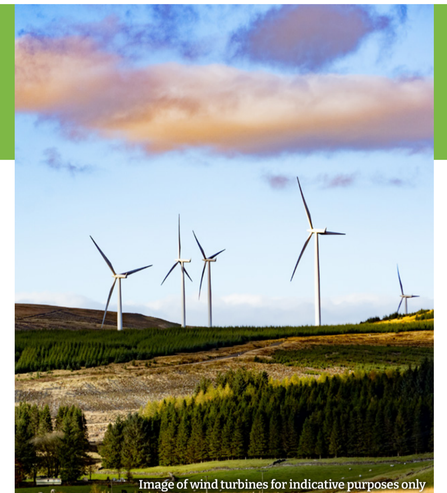
Image of wind turbines for indicative purposes only

Bydd Cynllun Gwarchod Rhywogaethau (SPP) yn cael ei gynnwys fel rhan o'r Cynllun Rheoli Amgylcheddol Adeiladu (CEMP). Yn ogystal, y mesurau a ddisgrifir yn HMP y datblygiad arfaethedig.